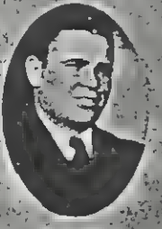
Al Ransisen Service Station